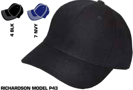
RICHARDSON MODEL P43